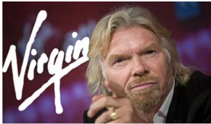
Richard Branson asks people about their entrepreneurial dream, and then backs them in a business