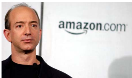
Jeff Bezos coaches people to get results by seeing differently and being different.

We often think of coaching in the context of sports or the performing arts. Today, when people talk about the leader as coach , more often it's just a new word to describe the same old thing. For example, people think of coaching as creating a people-friendly management, as empowerment programs, or as mentoring and counseling. Coaching is in fact none of these.