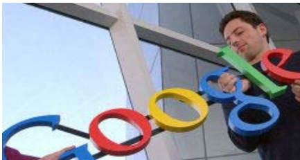
Sergey Brin asks people to spend 25% of their time doing something they are passionate about.